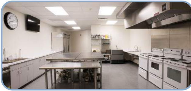
test kitchen & focus group/ multi-purpose room